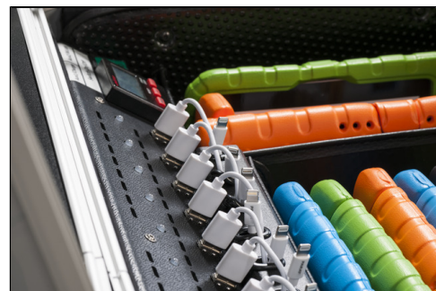
- 10x USB data and charging cable to lightning connector with LED display