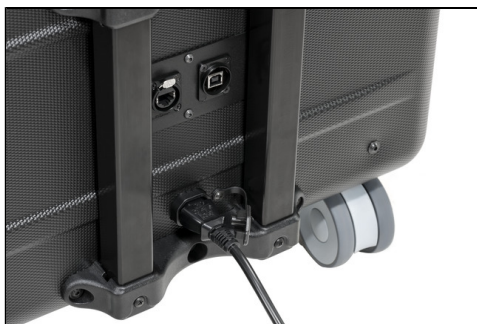
- central power supply with protective cap